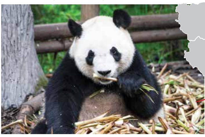
Sichuan Giant Panda Sanctuary

Beyond its manufacturing, chemical, pharmaceutical, and instrument industries, Chongqing possesses a dynamic tourism industry.